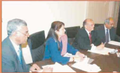
KCDR Management in meeting

"It was a great news to learn about KCDR which offers a quick, fair, and balanced mechanism for dispute resolution."